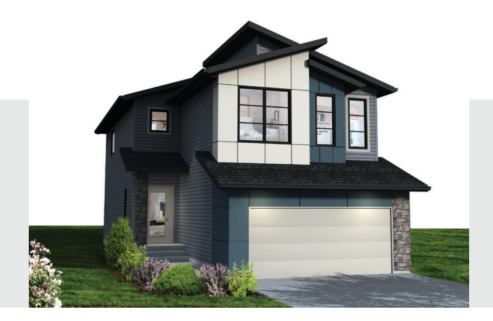
Kennedy K 2204 SQ FT 2136 Koshal Way SW